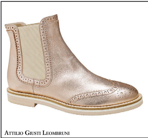
ATTILIO GIUSTI LEOMBRUNI