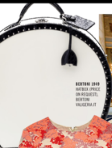
BERTONI 1949 HATBOX (PRICE ON REQUEST, BERTONI VULGIERA.IT