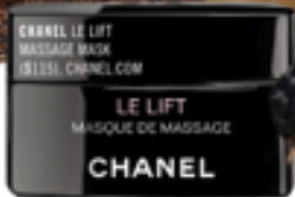
CHANEL LE LIFT MASSAGE MASK ($135), CHANEL.COM