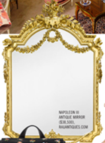
NAPOLEON III ANTIQUE MIRROR ($38,500), RAGANTIQUES.COM