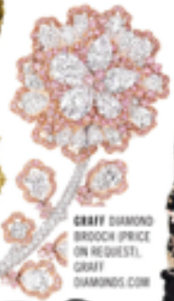
GRAFF DIAMOND BROOCH (PRICE ON REQUEST, GRAFF DIAMONDS.COM