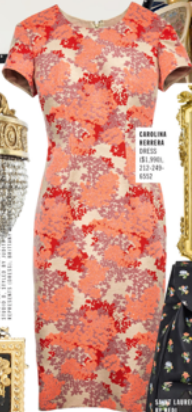
CAROLINA HERRERA DRESS ($1,990), 712-249- 6552