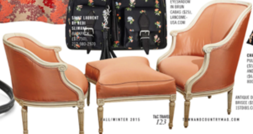
ANTIQUE DUCHESS BRISÉE ($3,700), 1STAIRS.COM