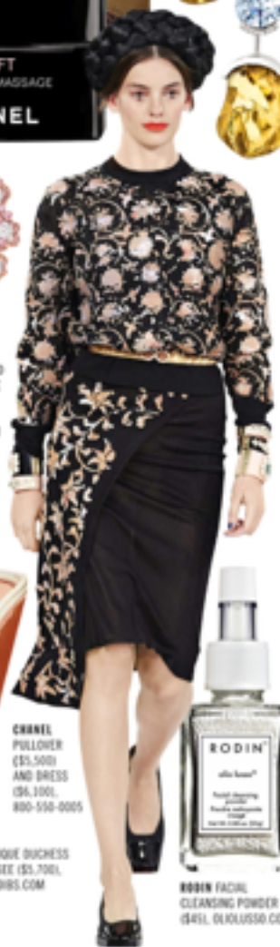
CHANEL PULLOVER ($1,500) AND DRESS ($4,100), 800-550-0005