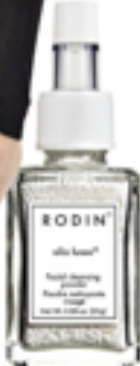
RODIN FACIAL CLEANSING POWDER ($45), DELUSSO.COM