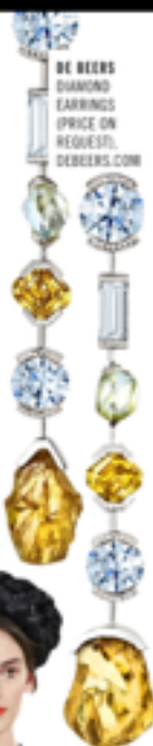
DE BEERS DIAMOND EARRINGS (PRICE ON REQUEST, DEBEERS.COM