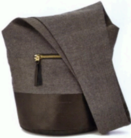
LARSEN & LUND