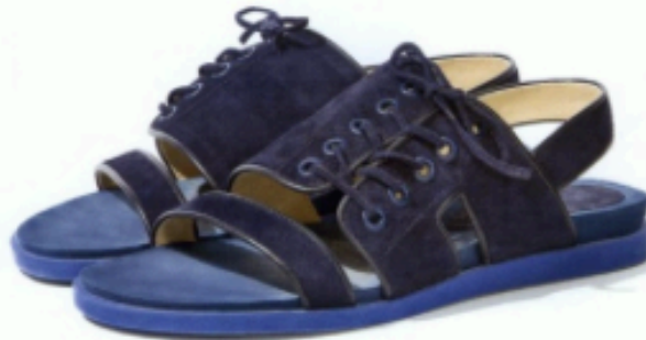
COMPTON DES COTONNIERS