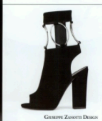
GIUSEPPE ZANOTTI DESIGN