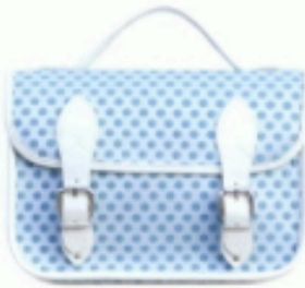
LE GRENIER DE VIVI